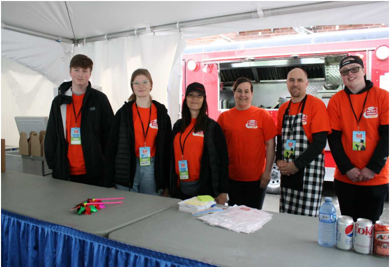
The mobile kitchen 'food crew'