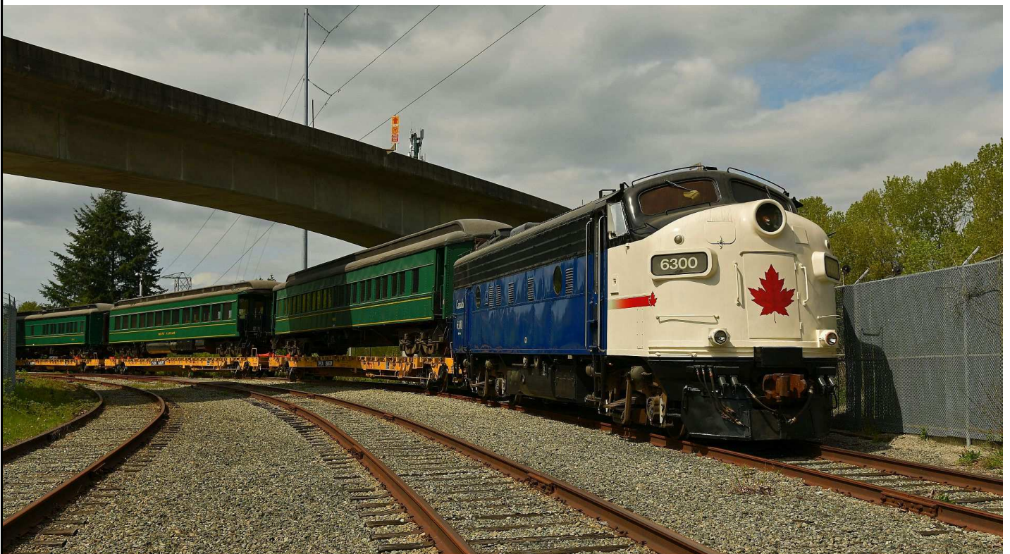
NRHS BC Chapter, Coaches 803, Mount Cascades, 301, & Lake Ontario, loaded Onto TPDx Flats And Being Switched By VIA 6300, Mile 145.2, CN New Westminster Sub, (New Westminster, 2019-04-26,)

The Heber Valley Historic Railroad is an independent agency of the State of Utah. It