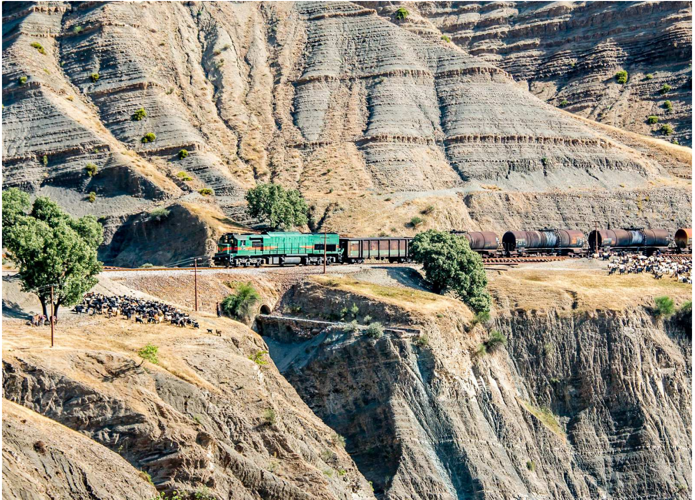
Photo—a US-built EMD GT26CW passes flocks of sheep and goats deep in the mountains of Lorestan Province, Iran.

The second half of our tour took us to central Iran, to the high mountains of Lorestan Province which is almost exactly halfway between the Caspian Sea and the Persian Gulf. Here the railway negotiates steep canyons through a roadless, largely barren landscape.