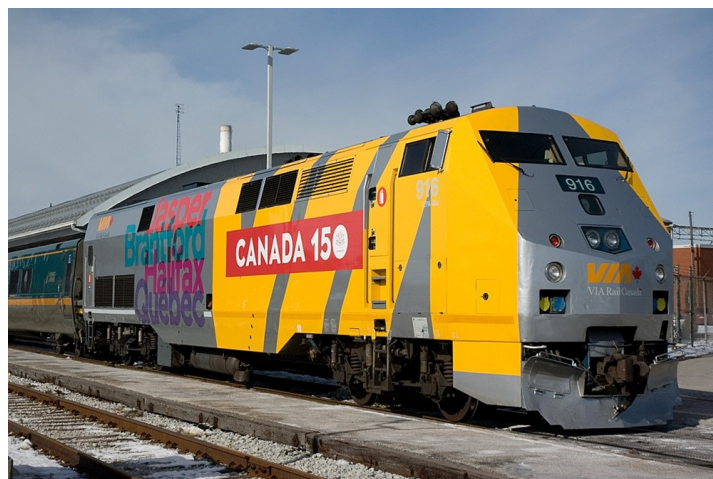
Loco GE P42DC with Canada 150 wrap

6410 Locomotive, 6426 Locomotive, 8615 Baggage, 8137 Coach, 8119 Coach, 8502 Skyline, 8331 Jarvis Manor, 8333 Lorne Manor, 1720 Panorama – off at Edmonton 8504 Skyline, 8409 Fairholme – Dining Car “A”, 8302 Allan Manor, 8309 Brant Manor 8318 Craig Manor, 8306 Bell Manor, 8325 Elgin Manor, 8319 Dawson Manor 8335 Mackenzie Manor, 8215 Chateau Lemoyne, 8510 Skyline, 8411 Imperial – Dining Car “B”, 88204 Chateau Cadillac (Prestige), 88206 Chateau Dennonville (Prestige) 88710 Prince Albert Park (Prestige) .