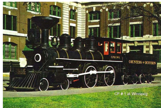
CP #1 at Winnipeg