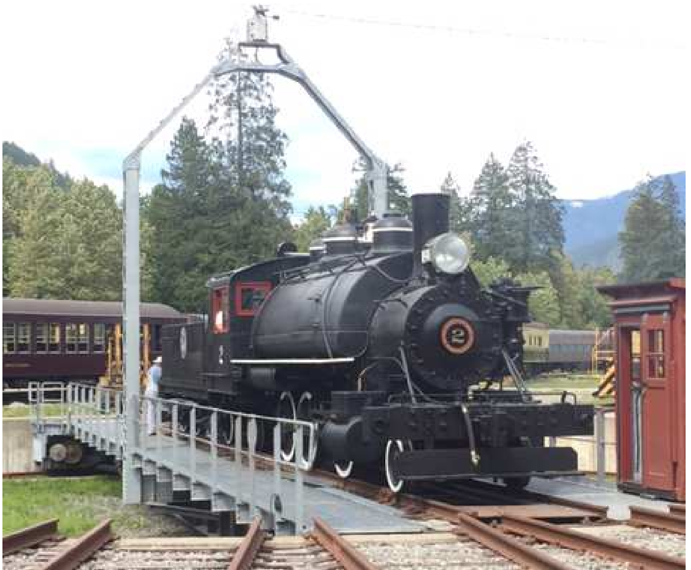
Photo—PGE #2 poses on the turntable May 14th before entering the roundhouse in Squamish