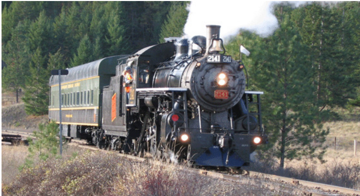
Kamloops Heritage Railway