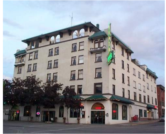
Plaza Heritage Hotel: your hotel in Kamloops