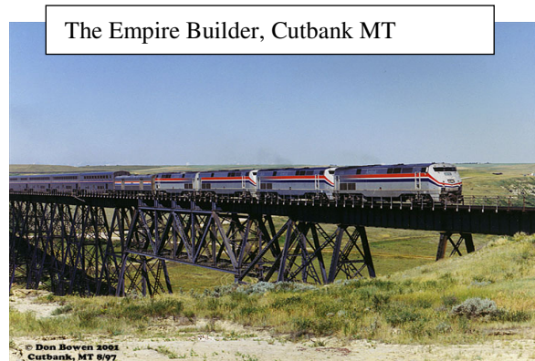
The Empire Builder, Cutbank MT

All services are booked direct to your personal credit card and are therefore subject to the terms and conditions of each carrier or service provider booked on your behalf.